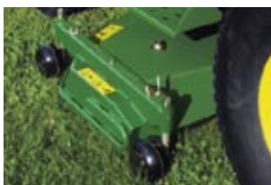
1.53 m (60") Rear Discharge deck