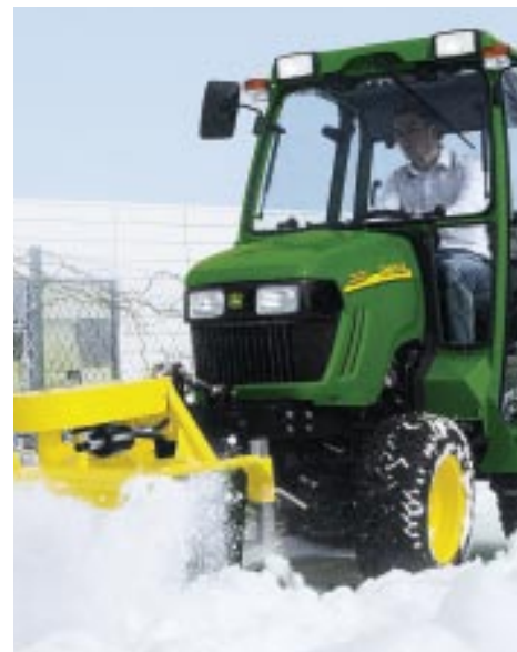
Clear snow and ice.

We began with the assumption: you can never have a tractor capable of doing too much. That's why we built into the 18 kW (24 hp) 2320 a full suite of capabilities – even to the point of mak-