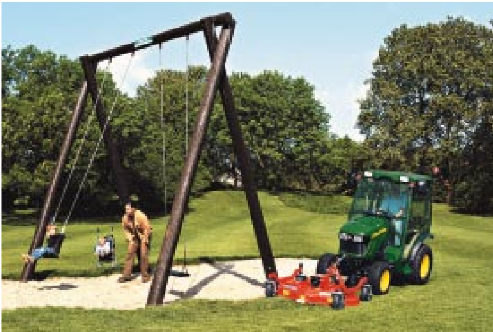
Maintain public property.