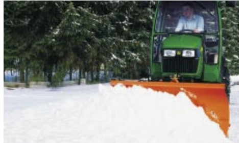
Move snow banks.