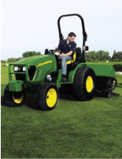
Handles heavy attachments easily.