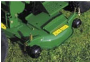
1.37 m (54") Drive-over deck

New OnRamp mower decks are the fastest in the industry to install, thanks to a pin-based drive on, drive off system.