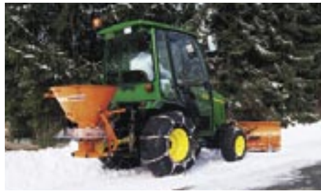
Spread everything from sand to seeds.