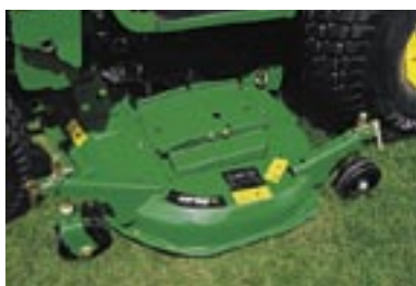
1.57 m (62") Drive-over deck