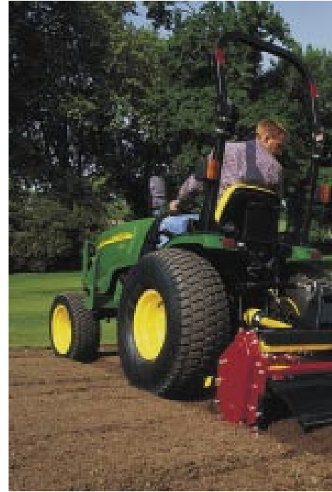
Prepare soil for planting.