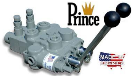
Auto Cycle Valve

Open Center hydraulic Valve: There are two basic valve systems used on log splitters: They come with different options