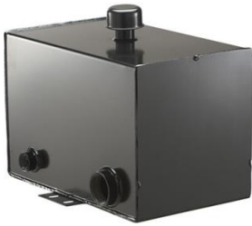
Hydraulic Oil Reservoir