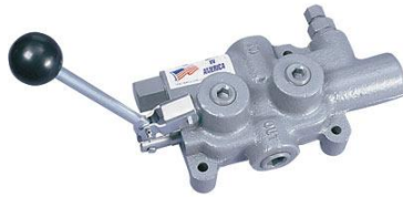
Log Splitter Valve