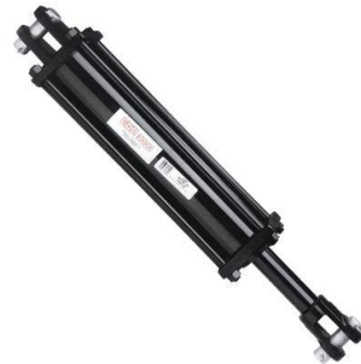
Tie-rod cylinder with clevis ends

Hydraulic Cylinder for Splitting: There is no "perfect" sized cylinder to use. The length depends on the length of the rounds you plan to split. Most of the home owner splitters you will see at tractor supply stores & lumber yards use a 24" length ram/rod. The diameter of the ram/rod will have a slight affect on the return time of the ram and affect the risk of bending the ram. The larger the diameter of the ram/rod, the faster it will return & will decrease the risk of bending the ram. The table below will give you a way to compare the cycle times of different bore cylinders with a 24" ram using a 16 gpm pump with no load. The diameter of the bore & the psi applied will determine the tonnage. If you plan to use a single edged wedge, a 4 - 4.5" bore works well, if you want a multiple edged wedge, you will need a larger bore for more tonnage.