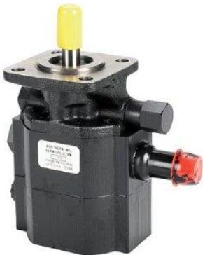
Haldex/Barnes 2 stage pumps

Electric Motor HP required: = gpm x psi / 1714 x % of pump efficiency ( http://www.engineeringtoolbox.com/hydraulic-pumps-horsepower-d_1464.html )