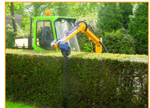
Versatile Cuts Both-sides