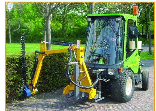
Front Mount Option