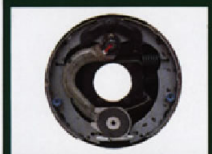
12 V. Electric Brakes

Now ... get 'em up and move 'em out quickly from behind the baler or from storage to feeding area.