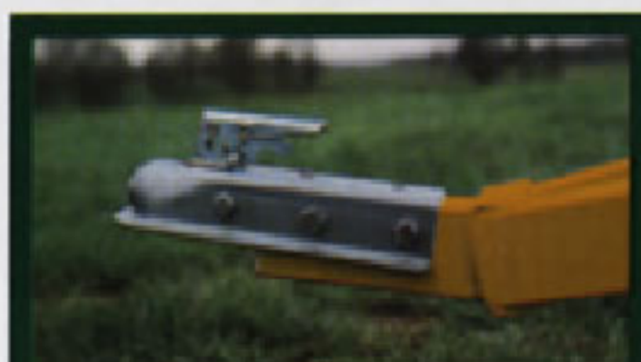
2" Ball Coupler

Save time, labor, money, and hay ... the TUMBLEBUG® way!